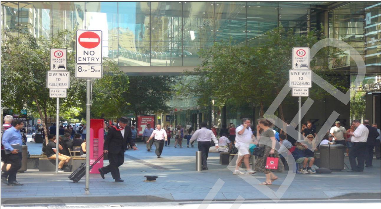
Figure 1. Photo and diagram of a Category 1 shared zone showing regulatory signage, typical layout and treatments. [Note: The No Entry sign is site specific] The photo may have been modified to demonstrate essential elements.