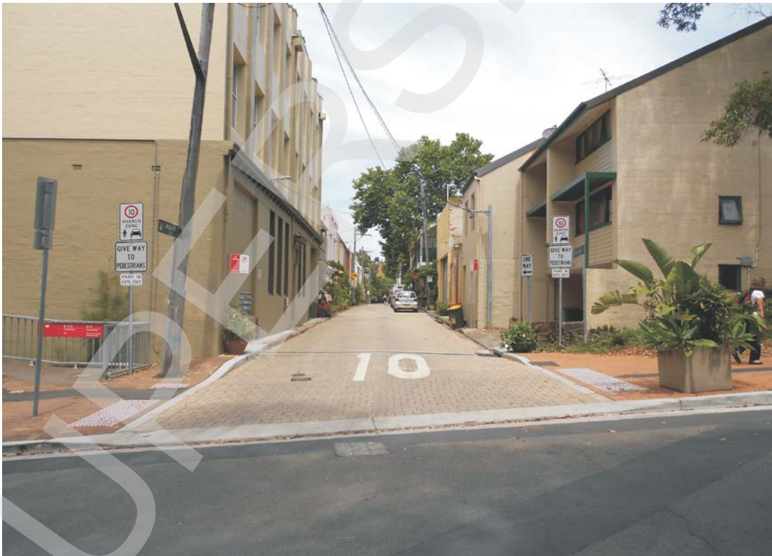
Figure 2. Photo and diagram of a Category 1 shared zone retaining kerb and gutter showing treatments, parking provision, and typical layout. The photo may have been modified to demonstrate essential elements.