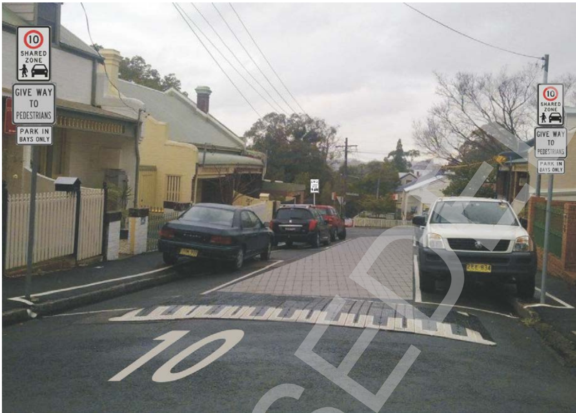
Figure 2. Photo and diagram of a Category 2 shared zone showing treatments, traffic calming, parking provision, and typical layout. ‘Give Way’ to Pedestrian’ pavement marking is optional.

The photo may have been modified to demonstrate essential elements.